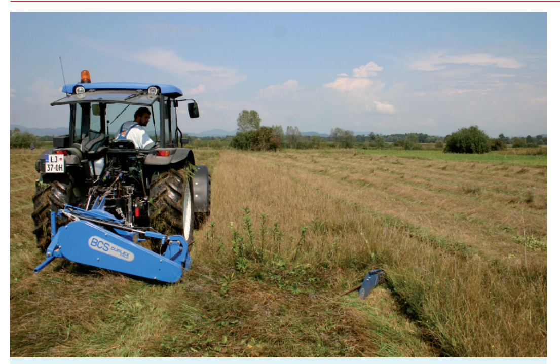
Fig. 2: Through appropriate habitat management, like late mowing of the unimproved wet meadows at the established nature reserve, we locally stabilized and enlarged population of Whinchats. – Durch geeignetes Biotopmanagement, wie z.B. spätes Mähen nicht bewirtschafteter Feuchtwiesen im Naturschutzgebiet "Iski Morost", konnte der Braunkehlchenbestand nicht nur stabilisiert, sondern sogar vergrößert werden.